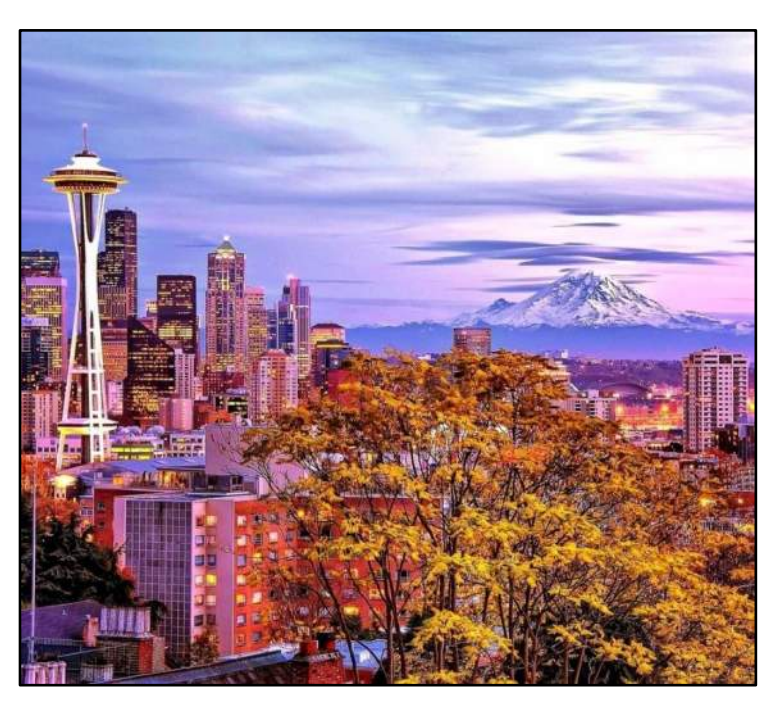
Figure 1. From the Pacific Coast: Seattle and Mt. Rainer in the Fall.

The tourism industry across the Corridor will benefit from renewing NCH passenger service. The sheer majesty of the NCH route is unparalleled. It rises from the vast waters of the Pacific and Great Lakes. It navigates powerful and storied river valleys—the Mississippi, the Red River of the North, the Missouri, Yellowstone, Clark Fork, and Columbia. It traverses twice as many miles of the Rocky Mountains as any other rail line. With proposed route options, it passes Mt. Rainier and Mt. Hood. In combination with its companion, the Empire Builder, visitors from around the globe will reach Yellowstone again, along with Theodore Roosevelt, North Cascades, Olympic, and Glacier National Parks.