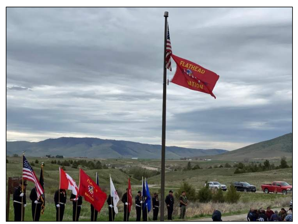
Figure 4. Historic Return of Bison Range to Confederated Salish and Kootenai Tribes by U.S. Dept. of the Interior.

The <u>Housing and Transportation Affordability Index</u> (H+T Index), developed by the Center for Neighborhood Technology, measures the cost of burden of housing and transportation within communities. Location efficiency metrics are part of the H+T Index, which considers communities that are close to jobs, services, and transportation availability. Neighborhood characteristics score access to jobs, public transit, and walkability on a scale of 1-10. The H+T Index also specifies annual transit costs and the percentage of residents who utilize public transit to commute to work. H+T Index data can be found in Table 2.