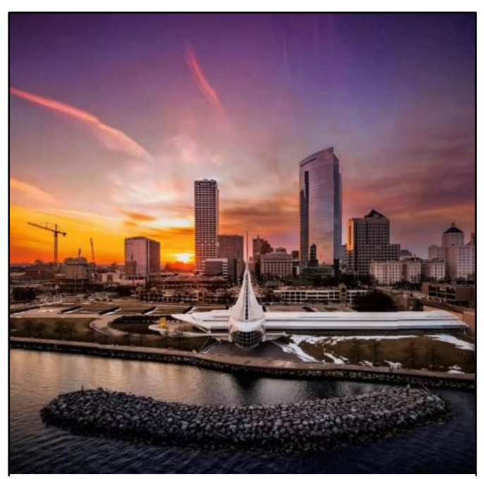
Figure 2. To the Great Lakes: Sunset over Milwaukee Art Museum and Skyline.