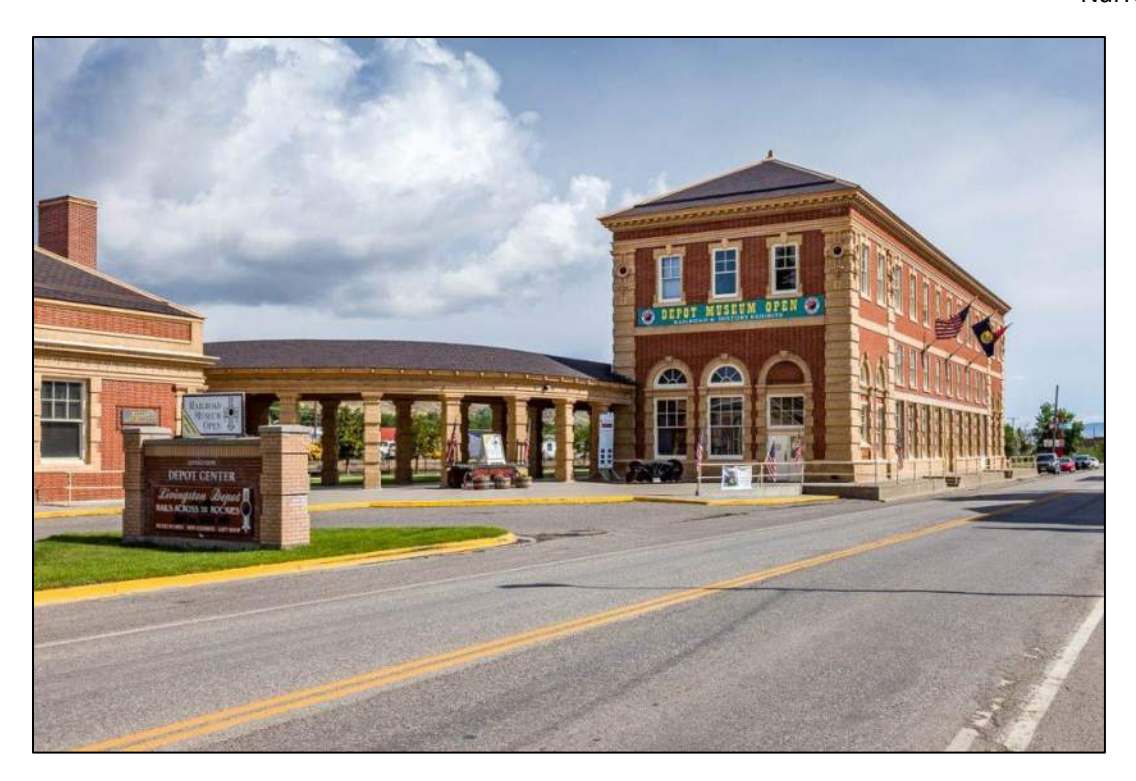
Figure 5. Restored Livingston, MT Railroad Depot Awaiting North Coast Hiawatha Passengers.